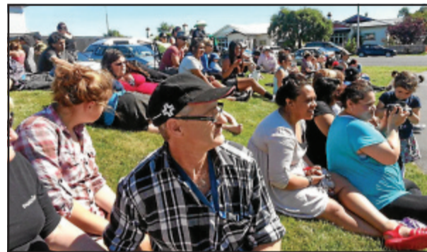
Some of the crowd at last summers concert

The stage is free to use, so if you play music, dance or act or have any kind of show, why not come down and entertain the community. Thanks to Bin Inn there is a free all-weather power source you can plug into if you need electricity. And if you tell us you'll be there, we can help you put the word out.