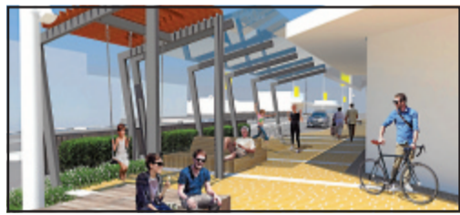
Corner Elles Rd & Grace St - daytime