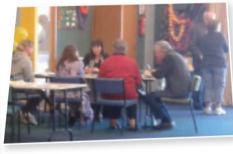
Residents at Appleby Housing 'Speed Dating' events talk with some of the agencies