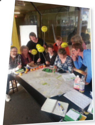
Zero Rubbish team Planning

Note to everyone that's adopted a street or park – no need to come for street allocation - you already have one! Just bring your rubbish by 1pm to the Blues Rugby Club and stay for the BBQ.