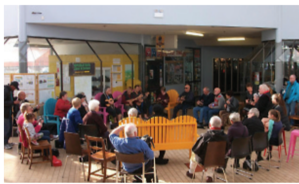
Some of the ukulele players enjoying the jam session