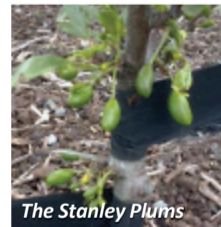
The Stanley Plums

Entries close Tuesday December 1 at 3pm. Tenants with great landlords, landlords with great tenants - nominate them in our annual competition to celebrate the spirit of pride in South Invercargill. Nomination forms are available by e-mail from southalive@gmail.com, or phone 218 6882, or call at the South Alive office, Shop 6 in South City Mall.