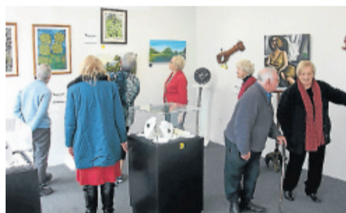
Members of the public visiting the exhibition

The roof fairly rattled! There will be another jam before Christmas so keep an eye on our Facebook page and noticeboard for the timing.